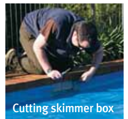
Cutting skimmer box